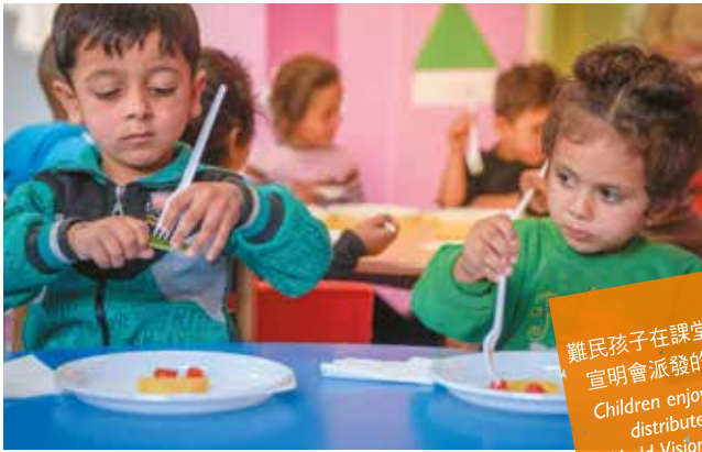
難民孩子在課堂上享用 宣明會派發的食物。 Children enjoy snacks distributed by World Vision in class.

宣明會為難民家庭提供糧食及食水，亦在營內為孩子安排康體及教育活動，令他們心理壓力得以紓緩，重獲童真。為了表達我們的關注及提供適切援助，請一起參加步行籌款，給難民家庭提供糧食援助，以及為孩子提供教育機會。